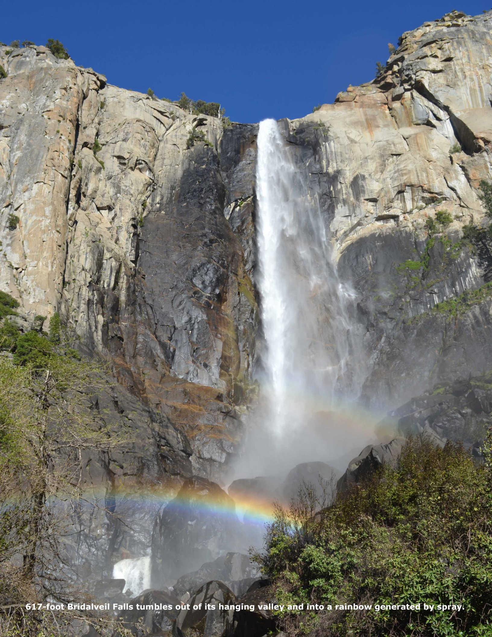
617-foot Bridalveil Falls tumbles out of its hanging valley and into a rainbow generated by spray.