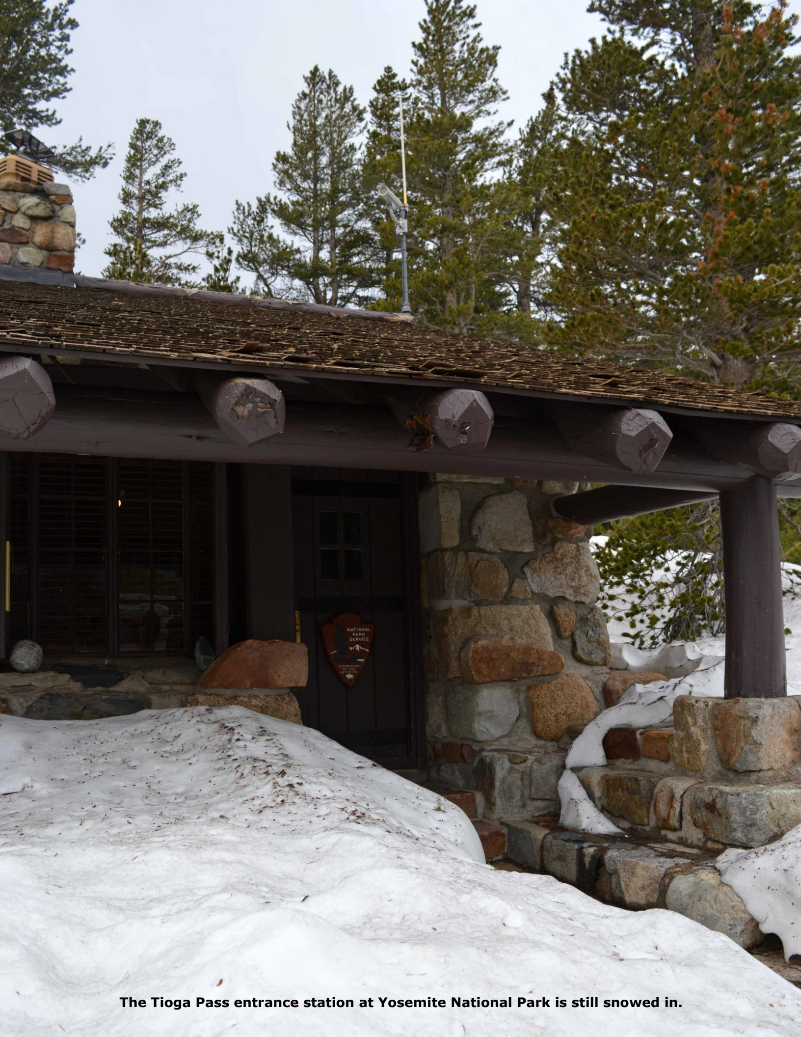
The Tioga Pass entrance station at Yosemite National Park is still snowed in.