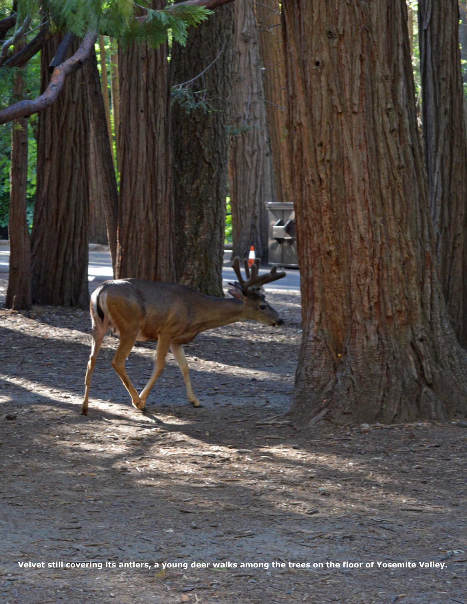
Velvet still covering its antlers, a young deer walks among the trees on the floor of Yosemite Valley.