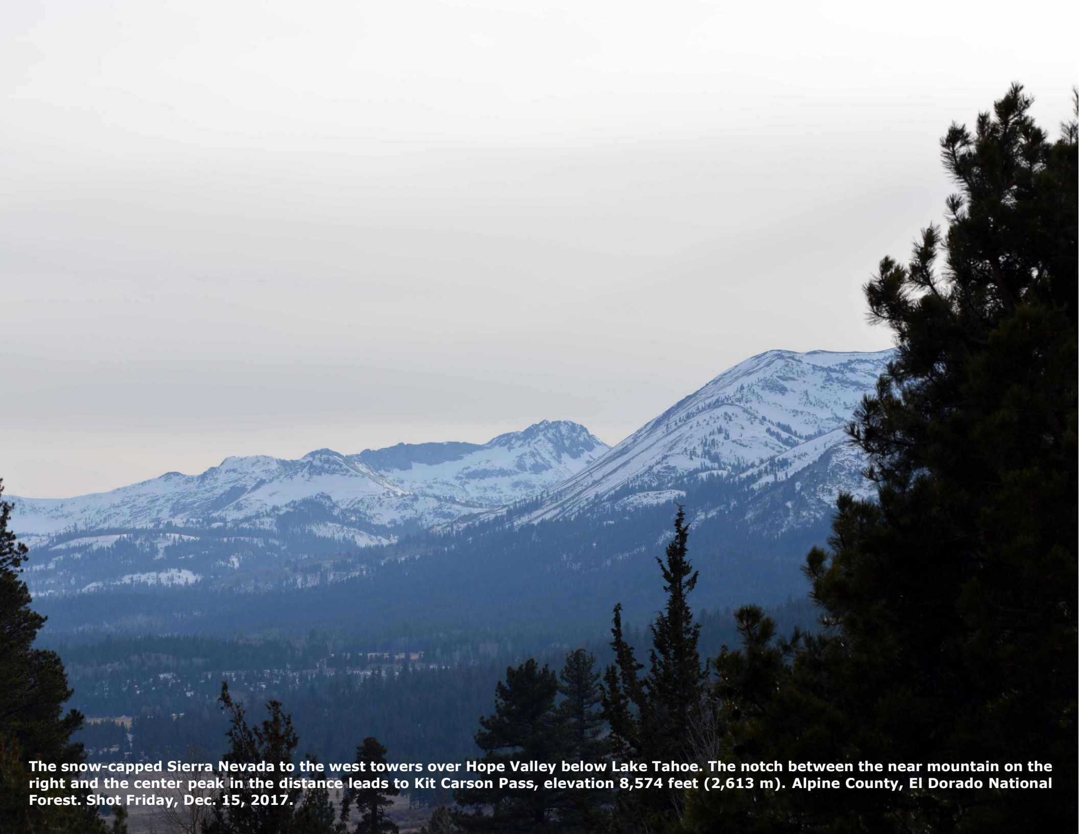
The snow-capped Sierra Nevada to the west towers over Hope Valley below Lake Tahoe. The notch between the near mountain on the right and the center peak in the distance leads to Kit Carson Pass, elevation 8,574 feet (2,613 m). Alpine County, El Dorado National Forest. Shot Friday, Dec. 15, 2017.