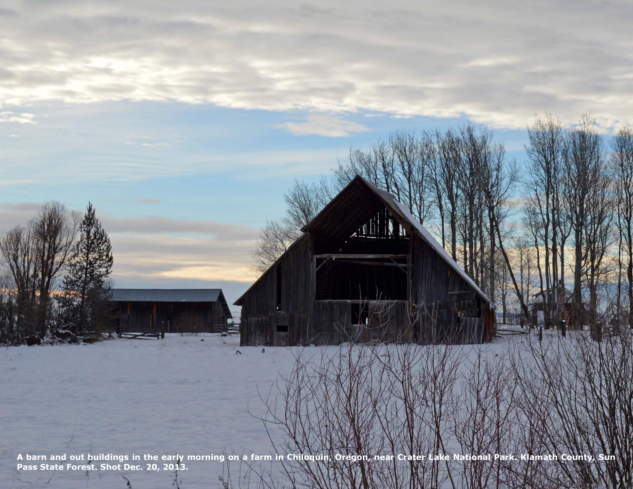
A barn and out buildings in the early morning on a farm in Chiloquin, Oregon, near Crater Lake National Park. Klamath County, Sun Pass State Forest. Shot Dec. 20, 2013.