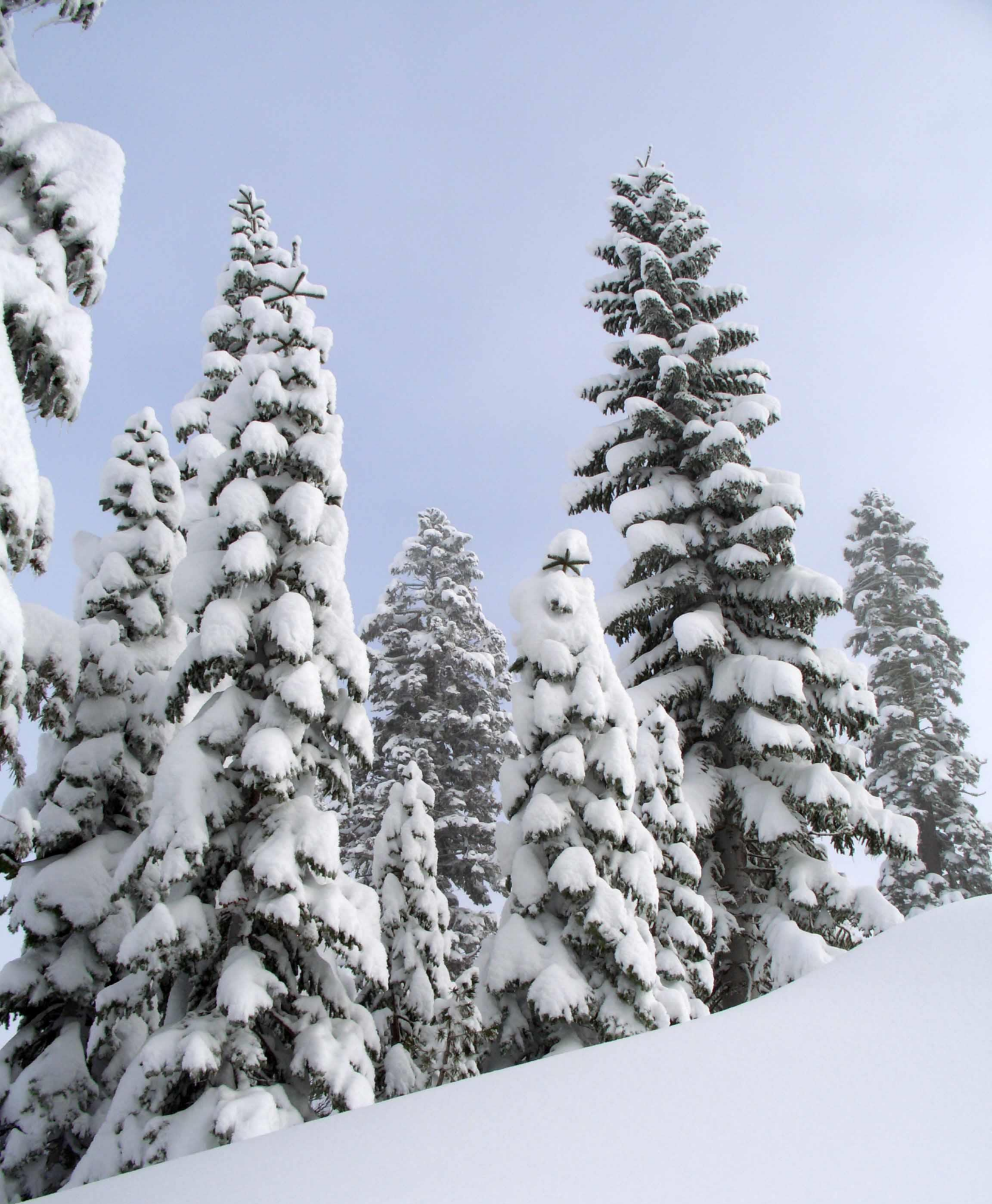
Trees burdened by heavy snow stand in Lassen Volcanic National Park in the California Cascade Range. Tehama County. Shot in December, 2010.