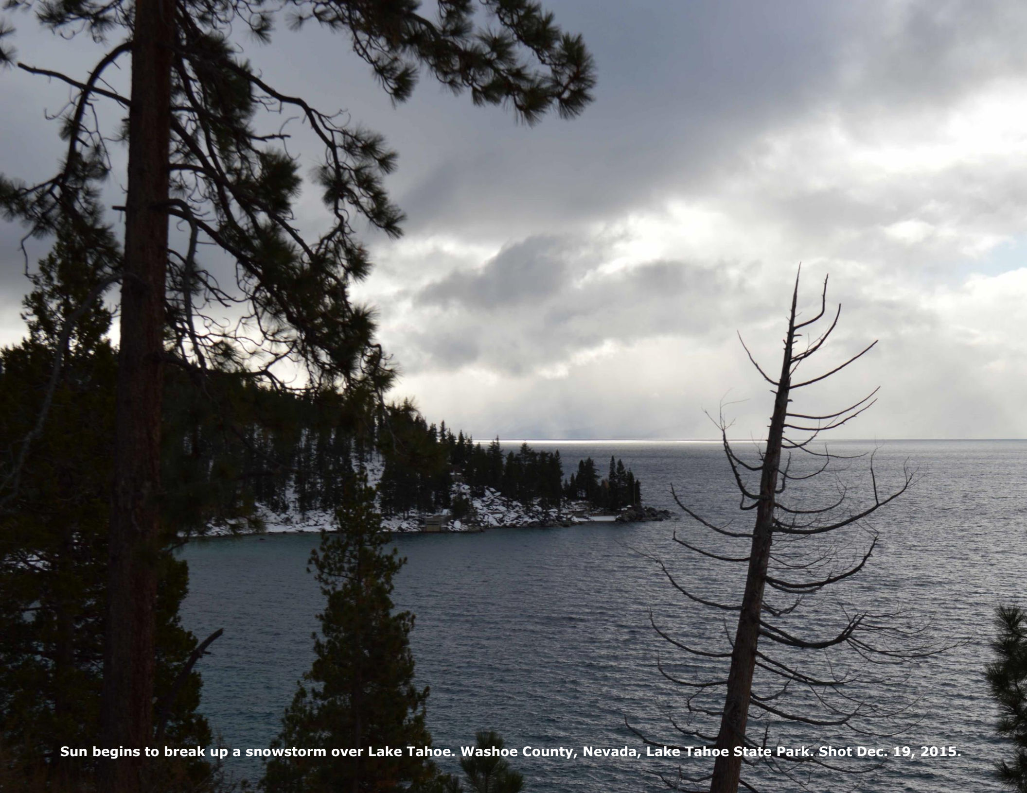
Sun begins to break up a snowstorm over Lake Tahoe. Washoe County, Nevada, Lake Tahoe State Park. Shot Dec. 19, 2015.