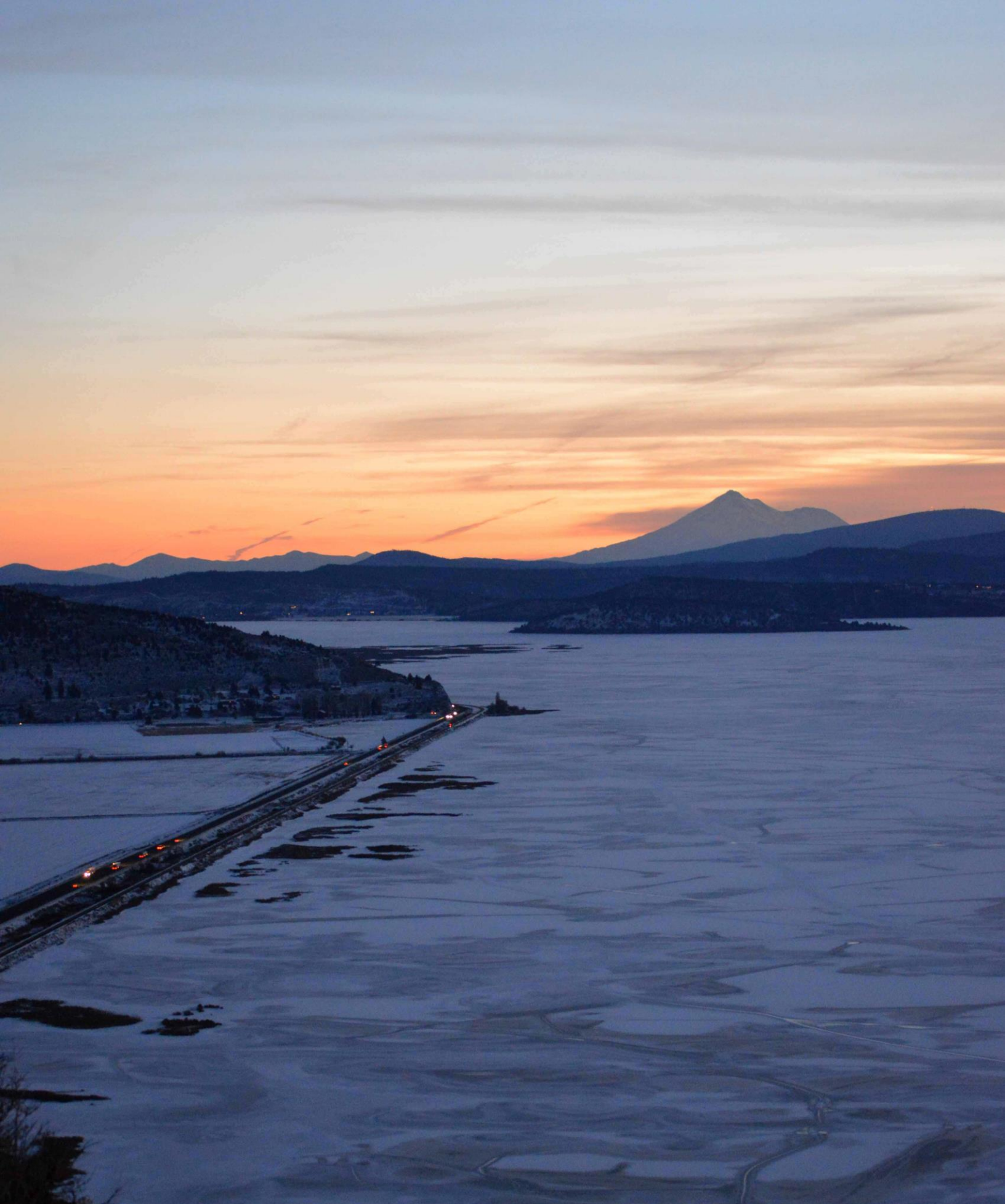
U.S. Highway 97 runs alongside frozen Klamath Lake just north of Klamath Falls, Oregon. The mountain in the background is 14,180-foot (4,320 m) Mount Shasta, California's tallest volcano, 80 miles to the south. Klamath County. Shot Dec. 19, 2013.