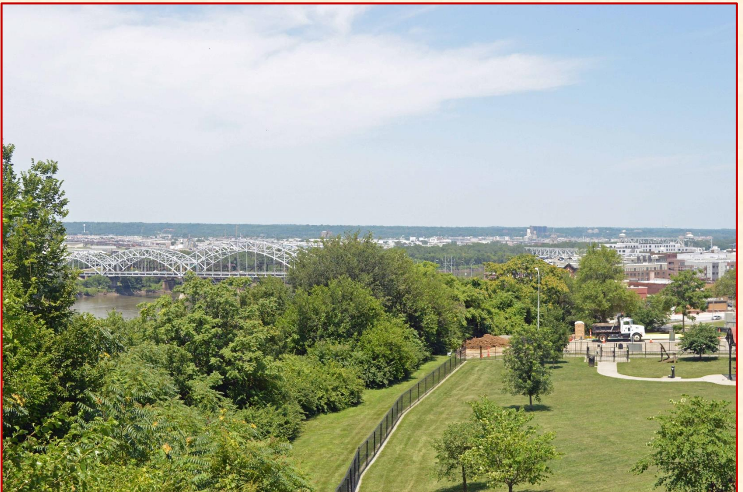
The Missouri River from downtown Kansas City's Case Park, where the Lewis and Clark Expedition stopped Sept. 15, 1806.

7 Demographics of Washington, D.C. , Wikipedia https://en.wikipedia.org/wiki/Demographics_of_Washington,_D.C.