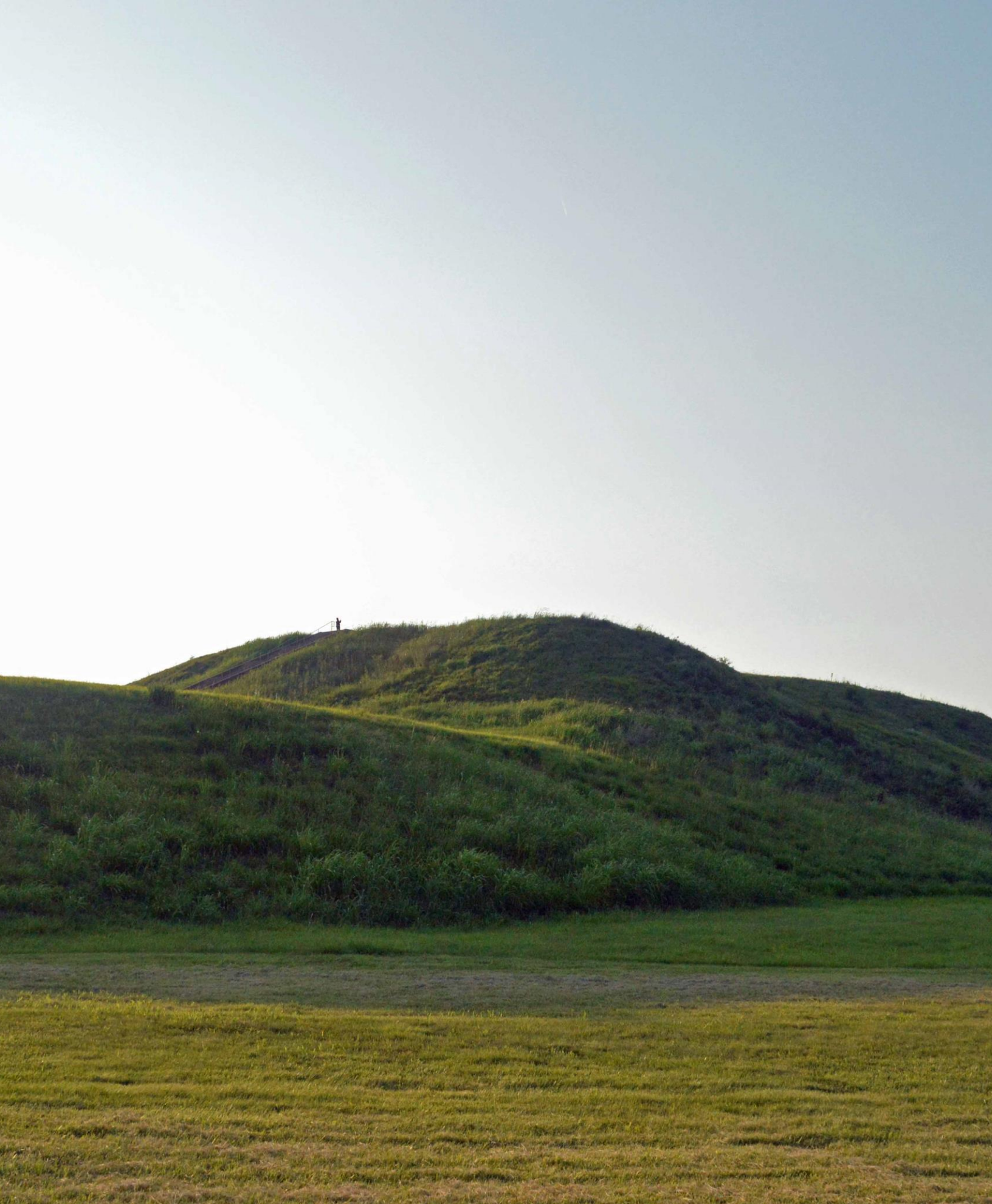
A man stands atop Monks Mound, which is one of 24 World Heritage Sites designated in the United States by the United Nations Educational, Scientific and Culture Organization (UNESCO).