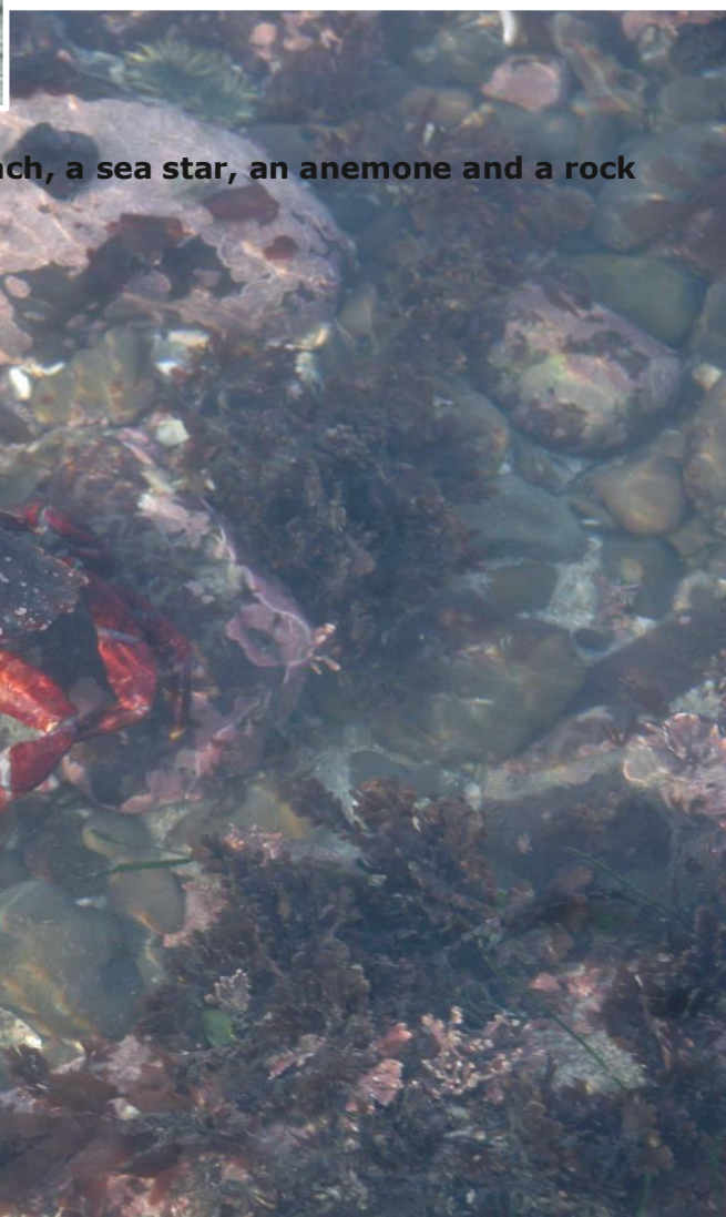
CLOCKWISE FROM TOP LEFT: A blue heron on landing approach, a sea star, an anemone and a rock crab.