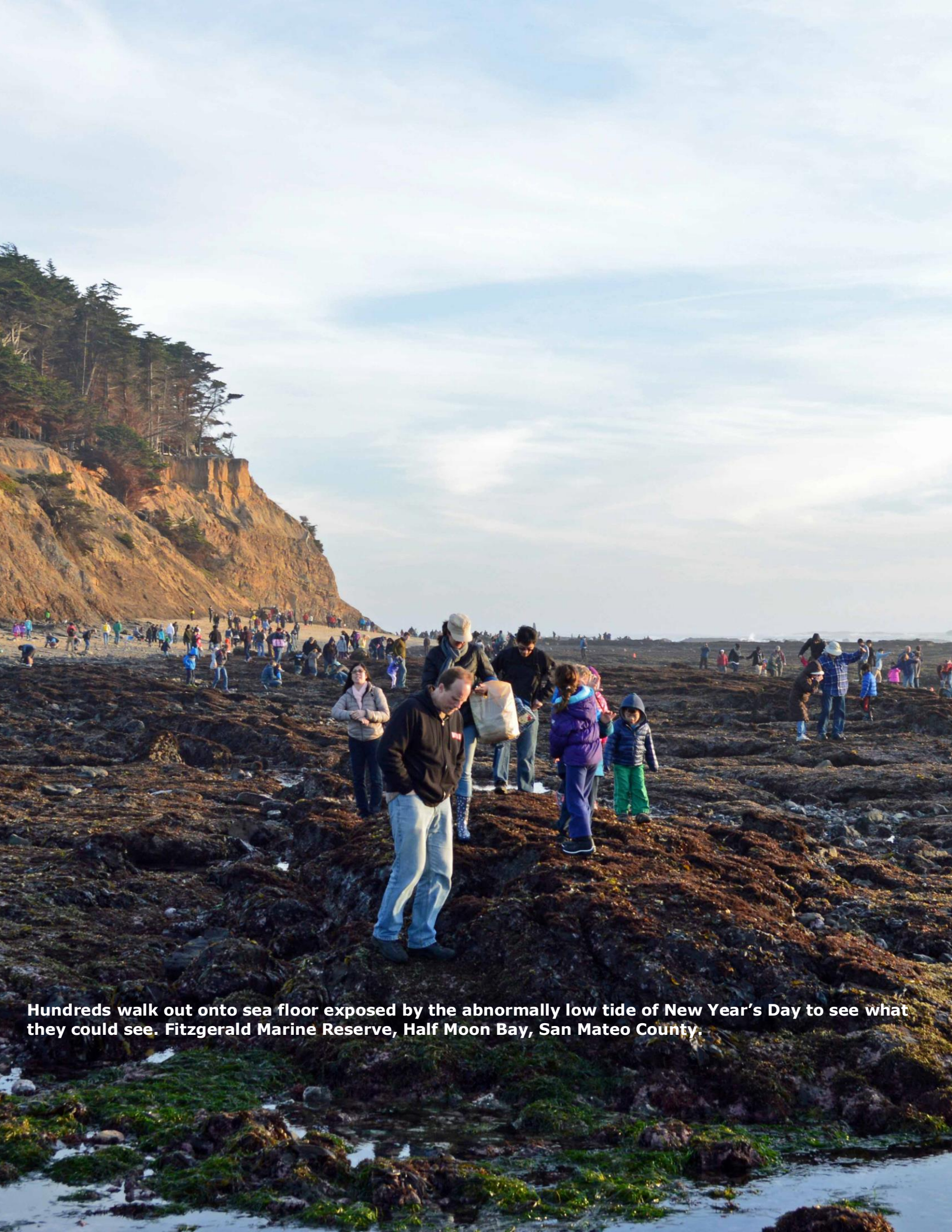
Hundreds walk out onto sea floor exposed by the abnormally low tide of New Year's Day to see what they could see. Fitzgerald Marine Reserve, Half Moon Bay, San Mateo County.